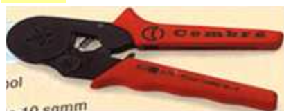
ZKE10 Ferrule Size mm 2 0.75 - 10.0