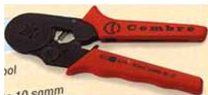
ZKE6 Ferrule Size mm 2 0.08 - 6.0