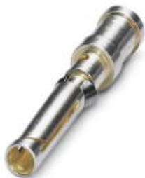
Turned 1.6 crimp contact, individual female contact, core diameter 0.75 to 1.00 mm 2 , silver-plated

Please be informed that the data shown in this PDF Document is generated from our Online Catalog. Please find the complete data in the user's documentation. Our General Terms of Use for Downloads are valid ( http://phoenixcontact.com/download )