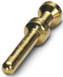
Turned 2.5 crimp contact, individual male contact, core diameter 0.5 mm 2 , gold-plated

Please be informed that the data shown in this PDF Document is generated from our Online Catalog. Please find the complete data in the user's documentation. Our General Terms of Use for Downloads are valid ( http://phoenixcontact.com/download )