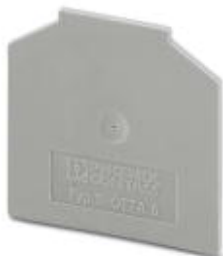
End cover, length: 43.5 mm, width: 1.5 mm, height: 40.8 mm, color: gray

Please be informed that the data shown in this PDF Document is generated from our Online Catalog. Please find the complete data in the user's documentation. Our General Terms of Use for Downloads are valid ( http://phoenixcontact.com/download )