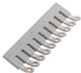
Insertion bridge, pitch: 11.1 mm, number of positions: 10, color: gray

Please be informed that the data shown in this PDF Document is generated from our Online Catalog. Please find the complete data in the user's documentation. Our General Terms of Use for Downloads are valid ( http://phoenixcontact.com/download )