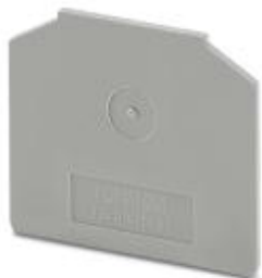
End cover, length: 60 mm, width: 2 mm, height: 52.6 mm, color: gray

Please be informed that the data shown in this PDF Document is generated from our Online Catalog. Please find the complete data in the user's documentation. Our General Terms of Use for Downloads are valid ( http://phoenixcontact.com/download )