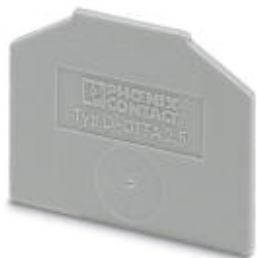
End cover, length: 43.5 mm, width: 1.5 mm, height: 34.3 mm, color: gray

Please be informed that the data shown in this PDF Document is generated from our Online Catalog. Please find the complete data in the user's documentation. Our General Terms of Use for Downloads are valid ( http://phoenixcontact.com/download )