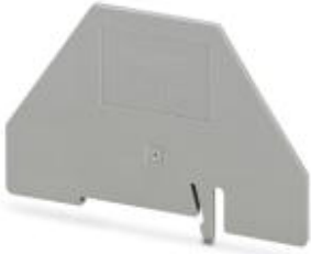
Partition plate, length: 83 mm, width: 2 mm, height: 60 mm, color: gray

Please be informed that the data shown in this PDF Document is generated from our Online Catalog. Please find the complete data in the user's documentation. Our General Terms of Use for Downloads are valid ( http://phoenixcontact.com/download )