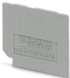
End cover, length: 24.5 mm, width: 1 mm, height: 20.9 mm, color: gray

Please be informed that the data shown in this PDF Document is generated from our Online Catalog. Please find the complete data in the user's documentation. Our General Terms of Use for Downloads are valid ( http://phoenixcontact.com/download )