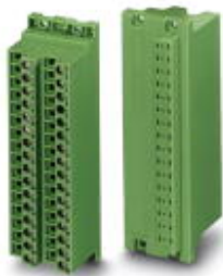
19" socket strip, number of positions: 32, pitch: 0 mm, color: green

Please be informed that the data shown in this PDF Document is generated from our Online Catalog. Please find the complete data in the user's documentation. Our General Terms of Use for Downloads are valid ( http://phoenixcontact.com/download )