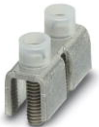
Fixed bridge, pitch: 20 mm, number of positions: 2, color: silver

Please be informed that the data shown in this PDF Document is generated from our Online Catalog. Please find the complete data in the user's documentation. Our General Terms of Use for Downloads are valid ( http://phoenixcontact.com/download )