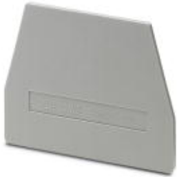
End cover, length: 61 mm, width: 2.2 mm, height: 48.5 mm, color: gray

Please be informed that the data shown in this PDF Document is generated from our Online Catalog. Please find the complete data in the user's documentation. Our General Terms of Use for Downloads are valid ( http://phoenixcontact.com/download )