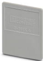
End cover, length: 28 mm, width: 1.5 mm, height: 33.4 mm, color: gray

Please be informed that the data shown in this PDF Document is generated from our Online Catalog. Please find the complete data in the user's documentation. Our General Terms of Use for Downloads are valid ( http://phoenixcontact.com/download )