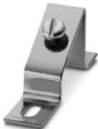
Angled brackets with M 6 screw, for fixing DIN rails at an angle of 30°, height: 35.4 mm

Please be informed that the data shown in this PDF Document is generated from our Online Catalog. Please find the complete data in the user's documentation. Our General Terms of Use for Downloads are valid ( http://phoenixcontact.com/download )