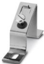
Angled brackets with M6 screw, DIN rail limit stop, for fixing DIN rails at an angle of 30°, height: 46 mm

Please be informed that the data shown in this PDF Document is generated from our Online Catalog. Please find the complete data in the user's documentation. Our General Terms of Use for Downloads are valid ( http://phoenixcontact.com/download )