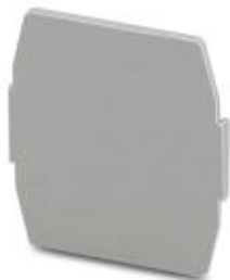
Separating plate, length: 22 mm, width: 0.5 mm, height: 22 mm, color: gray

Please be informed that the data shown in this PDF Document is generated from our Online Catalog. Please find the complete data in the user's documentation. Our General Terms of Use for Downloads are valid ( http://phoenixcontact.com/download )