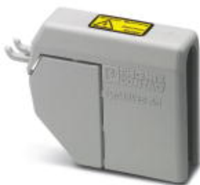
Covering hood, width: 28.8 mm, height: 59 mm, color: gray

Please be informed that the data shown in this PDF Document is generated from our Online Catalog. Please find the complete data in the user's documentation. Our General Terms of Use for Downloads are valid ( http://phoenixcontact.com/download )