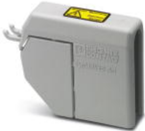
Covering hood, width: 36.8 mm, height: 65.5 mm, color: gray

Please be informed that the data shown in this PDF Document is generated from our Online Catalog. Please find the complete data in the user's documentation. Our General Terms of Use for Downloads are valid ( http://phoenixcontact.com/download )