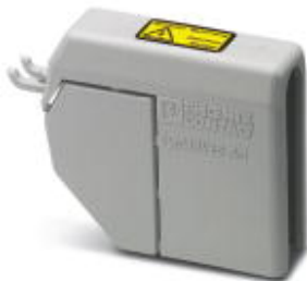
Covering hood, width: 43 mm, height: 71 mm, color: gray

Please be informed that the data shown in this PDF Document is generated from our Online Catalog. Please find the complete data in the user's documentation. Our General Terms of Use for Downloads are valid ( http://phoenixcontact.com/download )