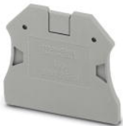
End cover, length: 47 mm, width: 2.2 mm, height: 39.8 mm, color: gray

Please be informed that the data shown in this PDF Document is generated from our Online Catalog. Please find the complete data in the user's documentation. Our General Terms of Use for Downloads are valid ( http://phoenixcontact.com/download )