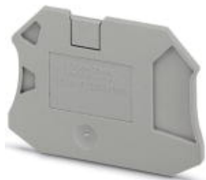
End cover, length: 56.8 mm, width: 2.2 mm, height: 39.8 mm, color: gray

Please be informed that the data shown in this PDF Document is generated from our Online Catalog. Please find the complete data in the user's documentation. Our General Terms of Use for Downloads are valid ( http://phoenixcontact.com/download )