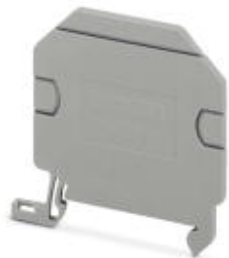
Partition plate, length: 53.4 mm, width: 2.2 mm, height: 45.7 mm, color: gray

Please be informed that the data shown in this PDF Document is generated from our Online Catalog. Please find the complete data in the user's documentation. Our General Terms of Use for Downloads are valid ( http://phoenixcontact.com/download )