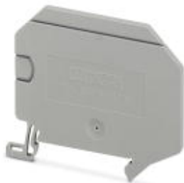
Partition plate, length: 62.1 mm, width: 2.2 mm, height: 52.5 mm, color: gray

Please be informed that the data shown in this PDF Document is generated from our Online Catalog. Please find the complete data in the user's documentation. Our General Terms of Use for Downloads are valid ( http://phoenixcontact.com/download )