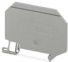
Partition plate, length: 69.7 mm, width: 2.2 mm, height: 52.5 mm, color: gray

Please be informed that the data shown in this PDF Document is generated from our Online Catalog. Please find the complete data in the user's documentation. Our General Terms of Use for Downloads are valid ( http://phoenixcontact.com/download )