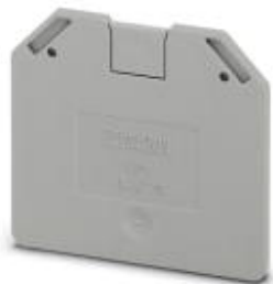
End cover, length: 52.8 mm, width: 2.2 mm, height: 47.3 mm, color: gray

Please be informed that the data shown in this PDF Document is generated from our Online Catalog. Please find the complete data in the user's documentation. Our General Terms of Use for Downloads are valid ( http://phoenixcontact.com/download )