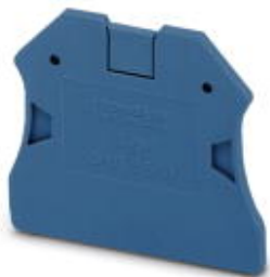
End cover, length: 47 mm, width: 2.2 mm, height: 39.8 mm, color: blue

Please be informed that the data shown in this PDF Document is generated from our Online Catalog. Please find the complete data in the user's documentation. Our General Terms of Use for Downloads are valid ( http://phoenixcontact.com/download )