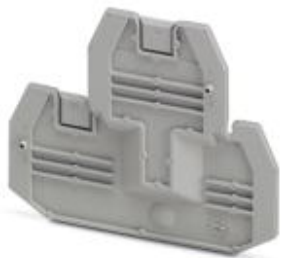
End cover, length: 69.9 mm, width: 2.2 mm, height: 57.5 mm, color: gray

Please be informed that the data shown in this PDF Document is generated from our Online Catalog. Please find the complete data in the user's documentation. Our General Terms of Use for Downloads are valid ( http://phoenixcontact.com/download )