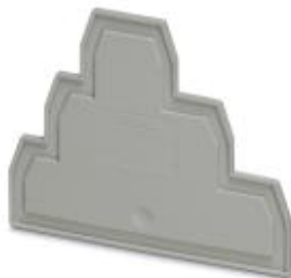
End cover, length: 90 mm, width: 2.2 mm, height: 69.8 mm, color: gray

Please be informed that the data shown in this PDF Document is generated from our Online Catalog. Please find the complete data in the user's documentation. Our General Terms of Use for Downloads are valid ( http://phoenixcontact.com/download )