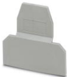
End cover, length: 56 mm, width: 2.5 mm, height: 52 mm, color: gray

Please be informed that the data shown in this PDF Document is generated from our Online Catalog. Please find the complete data in the user's documentation. Our General Terms of Use for Downloads are valid ( http://phoenixcontact.com/download )