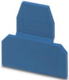
End cover, length: 56 mm, width: 2.5 mm, height: 62 mm, color: blue

Please be informed that the data shown in this PDF Document is generated from our Online Catalog. Please find the complete data in the user's documentation. Our General Terms of Use for Downloads are valid ( http://phoenixcontact.com/download )