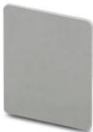
Separating plate, length: 14 mm, width: 0.5 mm, height: 16 mm, color: gray

Please be informed that the data shown in this PDF Document is generated from our Online Catalog. Please find the complete data in the user's documentation. Our General Terms of Use for Downloads are valid ( http://phoenixcontact.com/download )