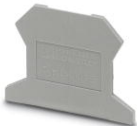
End cover, length: 42.5 mm, width: 1.5 mm, height: 30.7 mm, color: gray

Please be informed that the data shown in this PDF Document is generated from our Online Catalog. Please find the complete data in the user's documentation. Our General Terms of Use for Downloads are valid ( http://phoenixcontact.com/download )