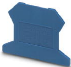
End cover, length: 42.5 mm, width: 1.5 mm, height: 30.7 mm, color: blue

Please be informed that the data shown in this PDF Document is generated from our Online Catalog. Please find the complete data in the user's documentation. Our General Terms of Use for Downloads are valid ( http://phoenixcontact.com/download )