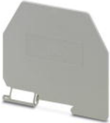
Partition plate, length: 99 mm, width: 2 mm, height: 90 mm, color: gray

Please be informed that the data shown in this PDF Document is generated from our Online Catalog. Please find the complete data in the user's documentation. Our General Terms of Use for Downloads are valid ( http://phoenixcontact.com/download )