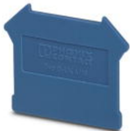
End cover, length: 42.5 mm, width: 1.8 mm, height: 47 mm, color: blue

Please be informed that the data shown in this PDF Document is generated from our Online Catalog. Please find the complete data in the user's documentation. Our General Terms of Use for Downloads are valid ( http://phoenixcontact.com/download )