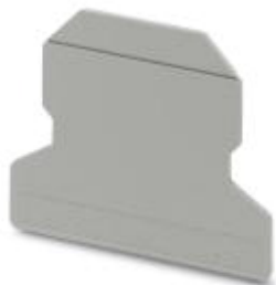
Partition plate, length: 56 mm, width: 1.5 mm, height: 45.7 mm, color: gray

Please be informed that the data shown in this PDF Document is generated from our Online Catalog. Please find the complete data in the user's documentation. Our General Terms of Use for Downloads are valid ( http://phoenixcontact.com/download )