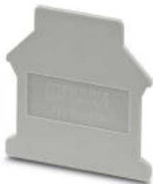
End cover, length: 42.5 mm, width: 1.5 mm, height: 54 mm, color: gray

Please be informed that the data shown in this PDF Document is generated from our Online Catalog. Please find the complete data in the user's documentation. Our General Terms of Use for Downloads are valid ( http://phoenixcontact.com/download )