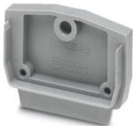
End cover, length: 32 mm, width: 4 mm, height: 22 mm, color: gray

Please be informed that the data shown in this PDF Document is generated from our Online Catalog. Please find the complete data in the user's documentation. Our General Terms of Use for Downloads are valid ( http://phoenixcontact.com/download )