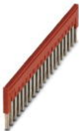
Plug-in bridge, pitch: 5.2 mm, number of positions: 20, color: red

Please be informed that the data shown in this PDF Document is generated from our Online Catalog. Please find the complete data in the user's documentation. Our General Terms of Use for Downloads are valid ( http://phoenixcontact.com/download )