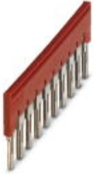
Plug-in bridge, pitch: 8.2 mm, width: 80.3 mm, number of positions: 10, color: red

Please be informed that the data shown in this PDF Document is generated from our Online Catalog. Please find the complete data in the user's documentation. Our General Terms of Use for Downloads are valid ( http://phoenixcontact.com/download )