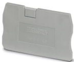
End cover, length: 48.6 mm, width: 2.2 mm, height: 29.1 mm, color: gray

Please be informed that the data shown in this PDF Document is generated from our Online Catalog. Please find the complete data in the user's documentation. Our General Terms of Use for Downloads are valid ( http://phoenixcontact.com/download )