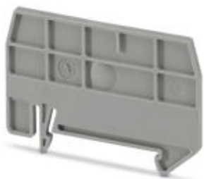
Partition plate, length: 59.8 mm, width: 2 mm, height: 39 mm, color: gray

Please be informed that the data shown in this PDF Document is generated from our Online Catalog. Please find the complete data in the user's documentation. Our General Terms of Use for Downloads are valid ( http://phoenixcontact.com/download )