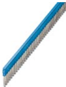
Plug-in bridge, pitch: 6.2 mm, width: 308.3 mm, number of positions: 50, color: blue

Please be informed that the data shown in this PDF Document is generated from our Online Catalog. Please find the complete data in the user's documentation. Our General Terms of Use for Downloads are valid ( http://phoenixcontact.com/download )