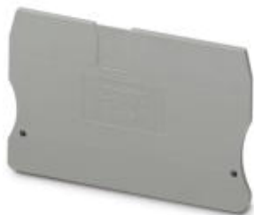
End cover, length: 71.5 mm, width: 2.2 mm, height: 49.9 mm, color: gray

Please be informed that the data shown in this PDF Document is generated from our Online Catalog. Please find the complete data in the user's documentation. Our General Terms of Use for Downloads are valid ( http://phoenixcontact.com/download )