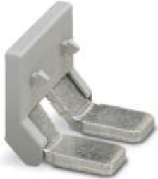
Insertion bridge, pitch: 25 mm, number of positions: 2, color: gray

Please be informed that the data shown in this PDF Document is generated from our Online Catalog. Please find the complete data in the user's documentation. Our General Terms of Use for Downloads are valid ( http://phoenixcontact.com/download )