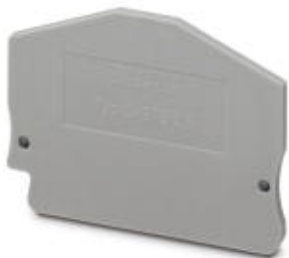
End cover, length: 51 mm, width: 2.2 mm, height: 43 mm, color: gray

Please be informed that the data shown in this PDF Document is generated from our Online Catalog. Please find the complete data in the user's documentation. Our General Terms of Use for Downloads are valid ( http://phoenixcontact.com/download )