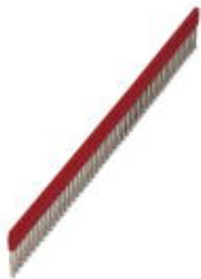
Plug-in bridge, pitch: 5.2 mm, number of positions: 50, color: red

Please be informed that the data shown in this PDF Document is generated from our Online Catalog. Please find the complete data in the user's documentation. Our General Terms of Use for Downloads are valid ( http://phoenixcontact.com/download )