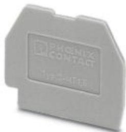
End cover, length: 22 mm, width: 1 mm, height: 17.7 mm, color: gray

Please be informed that the data shown in this PDF Document is generated from our Online Catalog. Please find the complete data in the user's documentation. Our General Terms of Use for Downloads are valid ( http://phoenixcontact.com/download )