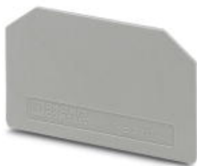
End cover, length: 46 mm, width: 1 mm, height: 28.7 mm, color: gray

Please be informed that the data shown in this PDF Document is generated from our Online Catalog. Please find the complete data in the user's documentation. Our General Terms of Use for Downloads are valid ( http://phoenixcontact.com/download )