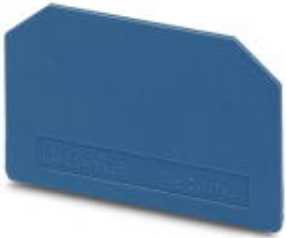
End cover, length: 46.2 mm, width: 1 mm, height: 28.3 mm, color: blue

Please be informed that the data shown in this PDF Document is generated from our Online Catalog. Please find the complete data in the user's documentation. Our General Terms of Use for Downloads are valid ( http://phoenixcontact.com/download )